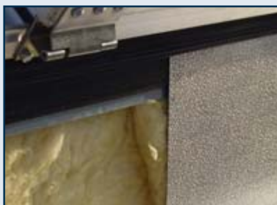
ESSMANN frame safety connection

The instructions for installing roof sealing systems must be observed at all times.