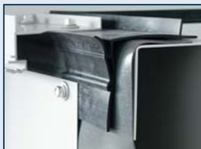
ESSMANN frame safety connection

Further information can be found at www.essmann.de