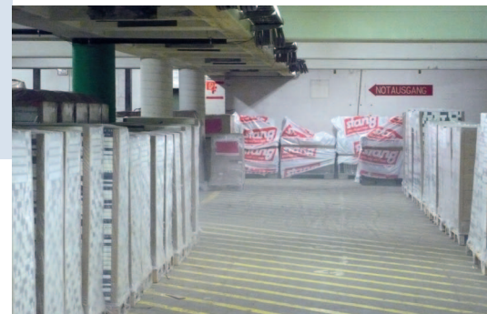
The room is virtually completely smoke-free after just 30 seconds, enabling the fire brigade to tackle the fire directly.