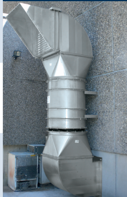
High-performance suction fan for effective smoke extraction, from ESSMANN