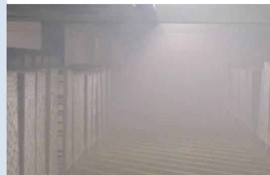
Smoke test with fog machine